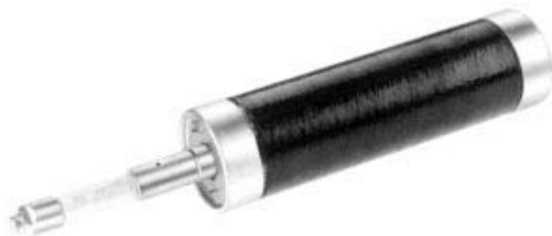
Figure 1. ELST Full Range Current-Limiting Tandem Fuse Assembly with current-limiting and expulsion sections for high and low fault current protection.